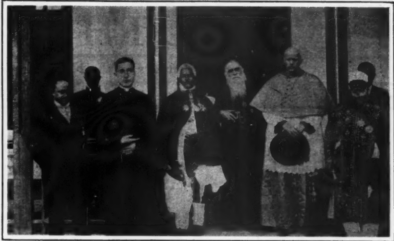
The Papal Commission to Ethiopia.

that the ruins of Zimbabwe date from a period 1000 or 4000 years before Christ. He has visited India and finds ruins there which parallel those in Africa. This with other evidence leads him to class the civilization of Zimbabwe as Sumerian. Frobenius did not add the fact that the Sumerians were undoubtedly black.